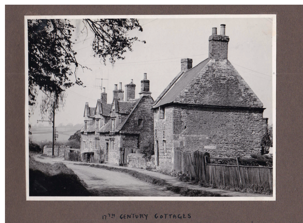
Bottom Street - formerly 'Far Street' see 1886 map

1886 Map - shows the village just before major changes were to happen. The Shields estate was sold to the Worralls, Wing Hall was built along with workers cottages along Top Street. Infilling development continued from this time at an average of approximately 10% every ten years. This has resulted in extensions to the village down Reeves Lane and eastward along Morcott and Glaston Roads and a greatly increased density overall.