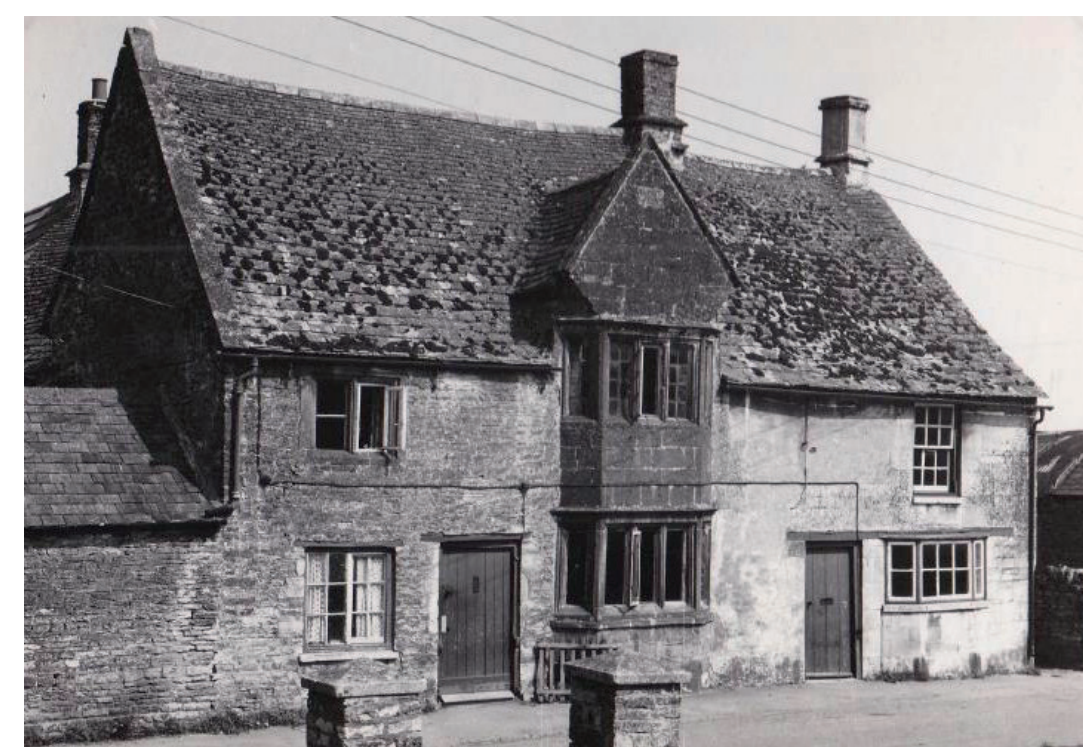
Townsend House, Morcott Road - formerly a series of cottages at the east end of the village